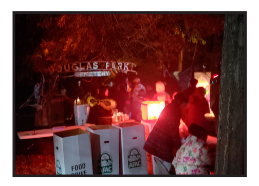
Food-banking by the Trail